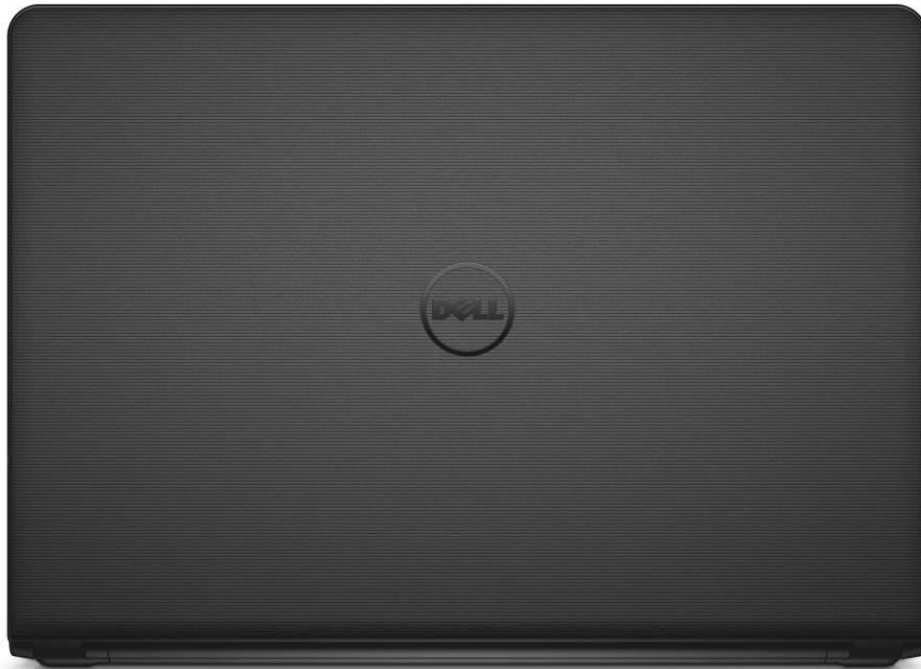
Micro Stripe pattern in Solid Black

Red option only available in some regions